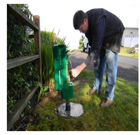
SRWD Technician takes a water sample from one of the District's many sampling stations:

Each element has different regulations to adhere to if they fall outside of the acceptable range. In the extremely rare occurrence that a parameter falls outside of the range, we will re-sample it. If it still falls out of the range, we will take whatever action is necessary to rectify the situation and follow the proper notification procedures.