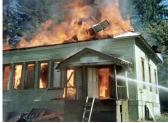
Fire protection is an important function of SRWD

Any measure of a successful society — low mortality rates, economic diversity, productivity, and public safety — is in some way related to access to safe water. We often take for granted that safe water is always accessible to drink, to wash our clothes, to water our lawns and for a myriad of other purposes.