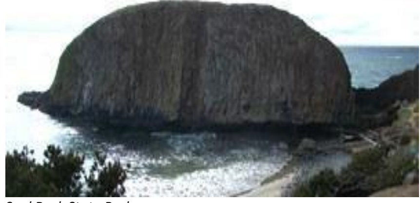
Seal Rock State Park