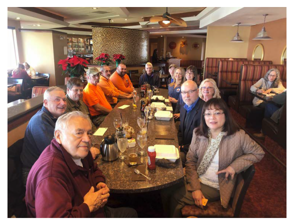
SRWD Board and Staff Appreciation Luncheon

Any measure of a successful society — low mortality rates, economic diversity, productivity, and public safety — is in some way related to access to safe water. We often take for granted that safe water is always accessible to drink, to wash our clothes, to water our lawns and for a myriad of other purposes.