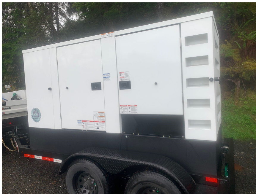
Emergency Standby Generator:

Operators also took delivery of a new trailer-mounted emergency generator on December 8th. Purchased with SDC funds, this generator will power the Beaver Creek Intake Pump Station. Crews received operational training from the vendor, including a simulation of power loss at the Intake Pump Station.