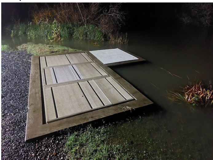
December 7 th 6:00 AM:

SRWD crews responded to several incidents related to recent storms. The Hatfield Marine Science Center (HMSC) reported just under ten inches of rain in the first week of December. The monthly average for December is 11.36 inches of rain. Crews recorded some of the highest levels on Beaver Creek. On December 8th, the Beaver Creek Intake was completely submerged underwater. Local firefighters reported that a vehicle was in Beaver Creek, lodged under a bridge three miles upstream of the district's intake. Crews temporarily shut down the intake until the report could be verified. Despite experiencing very high tides and sea swells, along with high flow levels in the Beaver Creek system, measurable conductivity was well within acceptable limits.