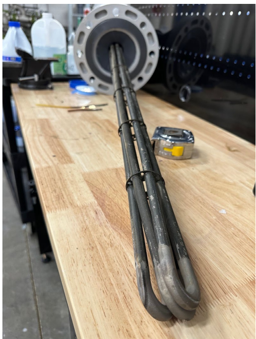
CIP Heating Rod:

Water Treatment Plant (WTP) Operators noticed that one of the three heater rods, essential for heating water to perform a Clean in Place (CIP) on the filter skids, had failed. The WTP was temporarily shut down to perform temporary repairs. Operators can successfully run the WTP using the two remaining heaters, but the heating process takes longer, extending the time necessary to perform a CIP. A new heater element has been ordered, with a six-week lead time.