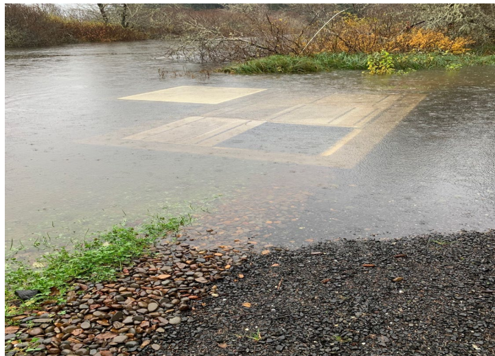
December 7 th 11:45 AM:

On December 7th, Field Operators responded to a water leak on the district's South Bay Road system. Arriving on site, they discovered major settling in several road areas and a slide at the four-mile marker, causing a leak on the district's 12-inch mainline feeding South Bay Road customers. Crews had to completely shut down the system, disrupting service to approximately six customers. They worked throughout the day and into the evening to restore service. Due to numerous slides and settling conditions, further repairs to the system are anticipated in the near future. This incident required the district to issue a Loss of Pressure Boil Water Notice to the affected area.