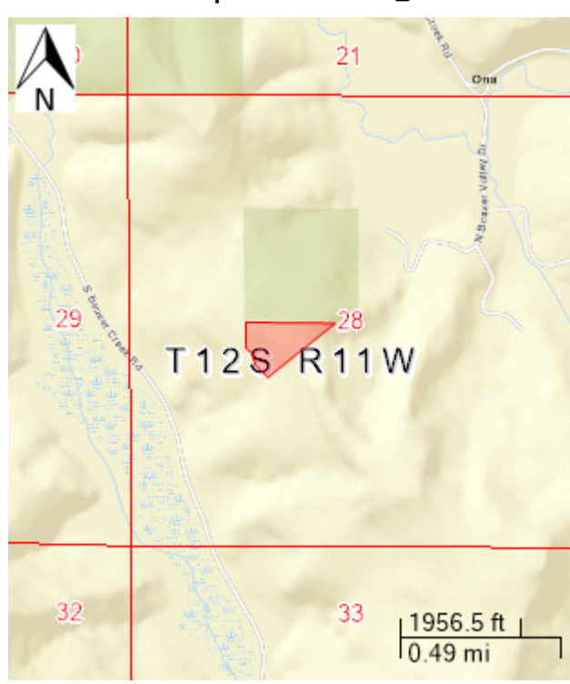
Unit Map: Unit240North_1: Ground