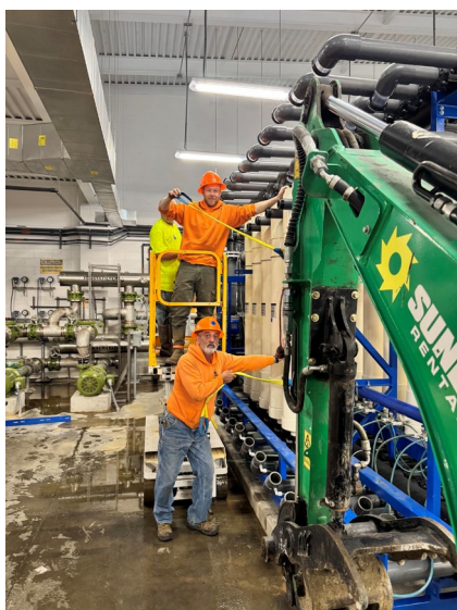
Filter module Removal:

Following installation, both membrane filtration skids were thoroughly flushed and conditioned to ensure system cleanliness and proper performance prior to returning the treatment process to service. District operators and WesTech technicians then completed startup procedures, performance testing, and system validation to confirm the upgraded membrane system was operating as designed.