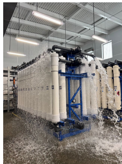
Completed Filter installation skid-1

Seal Rock Water District is an Equal Opportunity Service Provider and Employer.