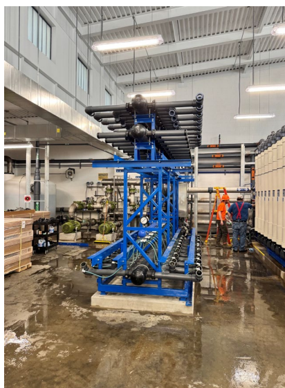
Flushed skid – 1 ready for new modules