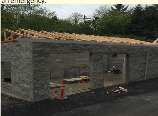
SRWD/Newport pump station and Intertie:

The District also has a connection with the City of Newport which is being improved through a grant provided by FEMA. The District's current intertie is insufficient to provide water in the event of failure in the District's Supply System. SRWD is currently in the construction phase of installing a new intertie and pump station capable of providing water in both directions, strengthening the District's ability to provide service in the event of an emergency.