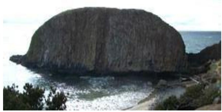
Seal Rock State Park

The Seal Rock Water District consistently delivers water that meets or exceeds all federal and state standards.