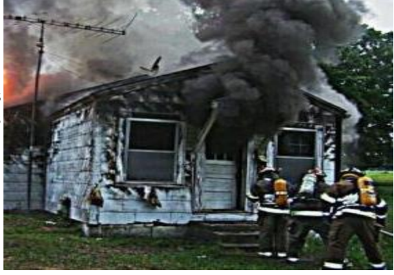
Fire protection is an important function of SRWD