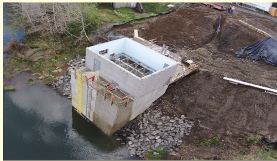
Newly Constructed Siletz River Intake:

SRWD is committed to having multiple quality water supplies. This redundancy allows SRWD to better manage resources to reliably provide water to customers.