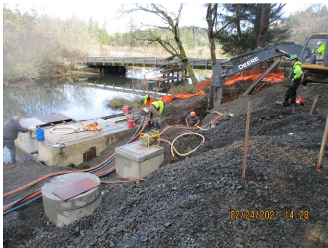
Beaver Creek Intake:

The Contractor has taken the preload elevation down to base elevation and has begun the process of installing power vaults and covers over the pipe gallery. Erosion control BMPs are in place and have been reestablished for the wet weather season. There is limited construction activity in this area.