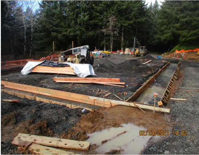
Membrane Building footings: