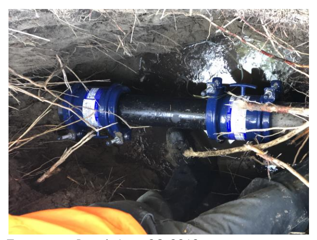
Temporary Repair June 26, 2019: