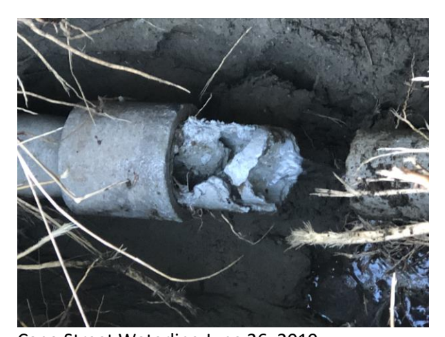
Cano Street Waterline June 26, 2019:

Again, on June 26<sup>th</sup> crews were dispatched to a report of no water on Canoe Street in Bayshore. The is the second leak this month in this area. Crews discovered that the 4-inch mainline serving this area had ruptured. Condition of the pipe is extremely poor and is likely more widespread. Crews are evaluating the option of replacing short sections of mainline on Canoe and Cunard Street using internal forces to facilitate permanent repair.